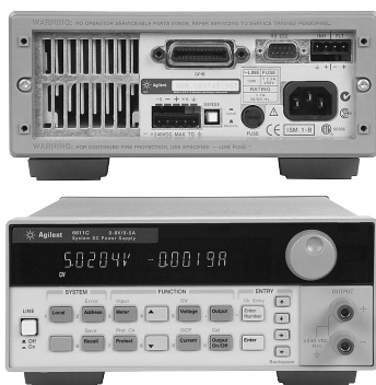
6611C - 6614C