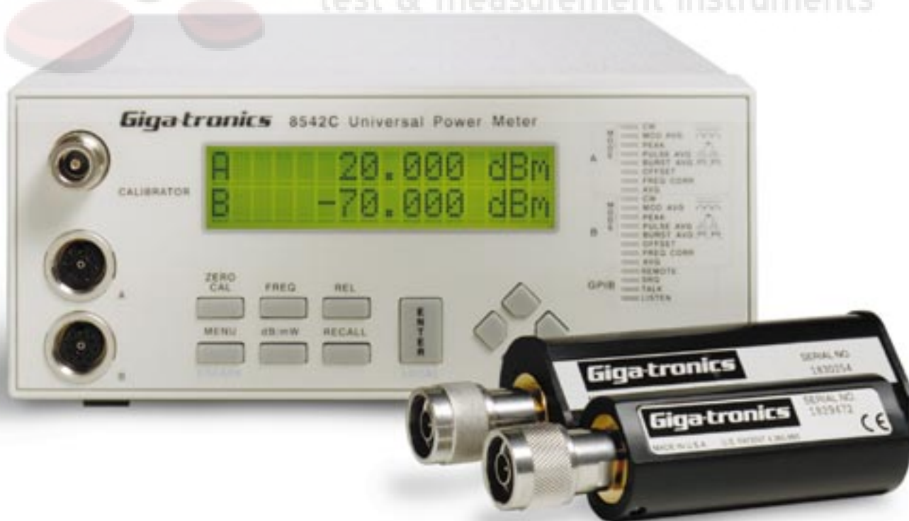
The Giga-tronics 8540C Series combines the speed, range, and capabilities needed to test today's sophisticated communications systems.

The exclusive Time Gating feature of the 8540C lets you program a measurement start time and duration to measure the average power during a specific time slot of a burst signal. This is critical for accurately measuring the average power of GSM, NADC and