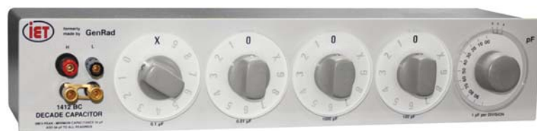
Model 1412-BC Decade Capacitor

The wide capacitance range and high resolution of this decade capacitance box make it exceptionally useful in both laboratory and test shop. Owing to its fine adjustment of capacitance, it is a convenient variable capacitor to use with an impedance comparator. The polystyrene dielectric used in the decade steps is necessary for applications requiring low dielectric absorption and constancy of both capacitance and dissipation factor with frequency.