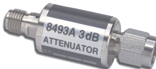
8493A Coaxial Fixed Attenuator